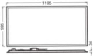
LDVAL PL0612B TRI